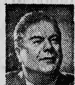
PININ FARINA TURIN, ITALY Motor car designer for royalty, winner of more than a hundred Grand Prix awards at International Auto shows.

Yes, come and see a thousand and one new ideas in cars that are completely and entirely new from road to roof—the finest of our fifty years! Now on display, ready to see and drive, at your Nash dealer's.