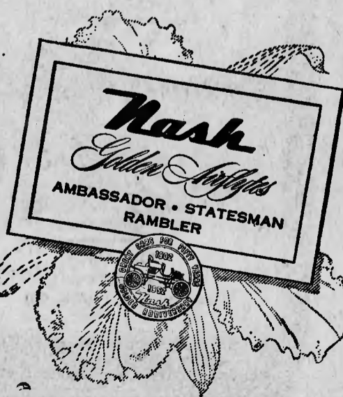
Nash Motors, Division Nash-Kelvinator Corporation, Detroit, Mich.