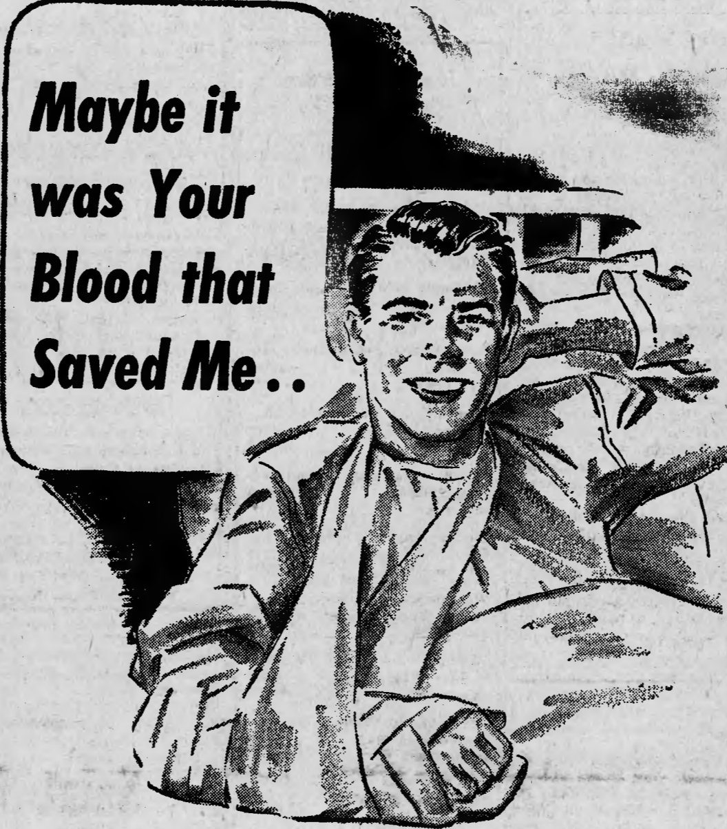
Red Cross Fund campaign poster for 1952