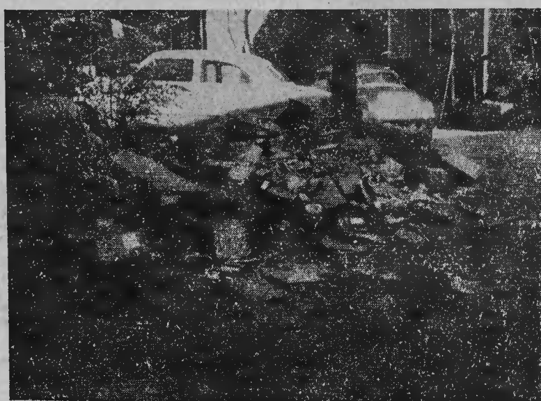
Why There's An Ordinance: Left, Residential Area Mess. Right, Trash At Rear Of Stores