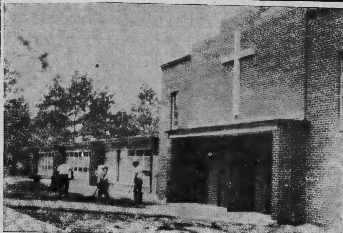
READY TO OPEN—Workmen put finishing touches on the grounds of the new St. Anthony's Catholic school built during the past summer and opening next week. At right are doors to the auditorium and extending to the left is the classroom wing.