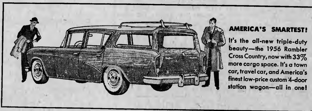
AMERICA'S SMARTEST! It's the all-new triple-duty beauty—the 1956 Rambler Cross Country, now with 33% more cargo space. It's a town car, travel car, and America's finest low-price custom 4-door station wagon—all in one!

Yes, come today and see the new Ramblers that cost least to buy, least to run and bring most when you trade. Make the Smart Switch for '56!