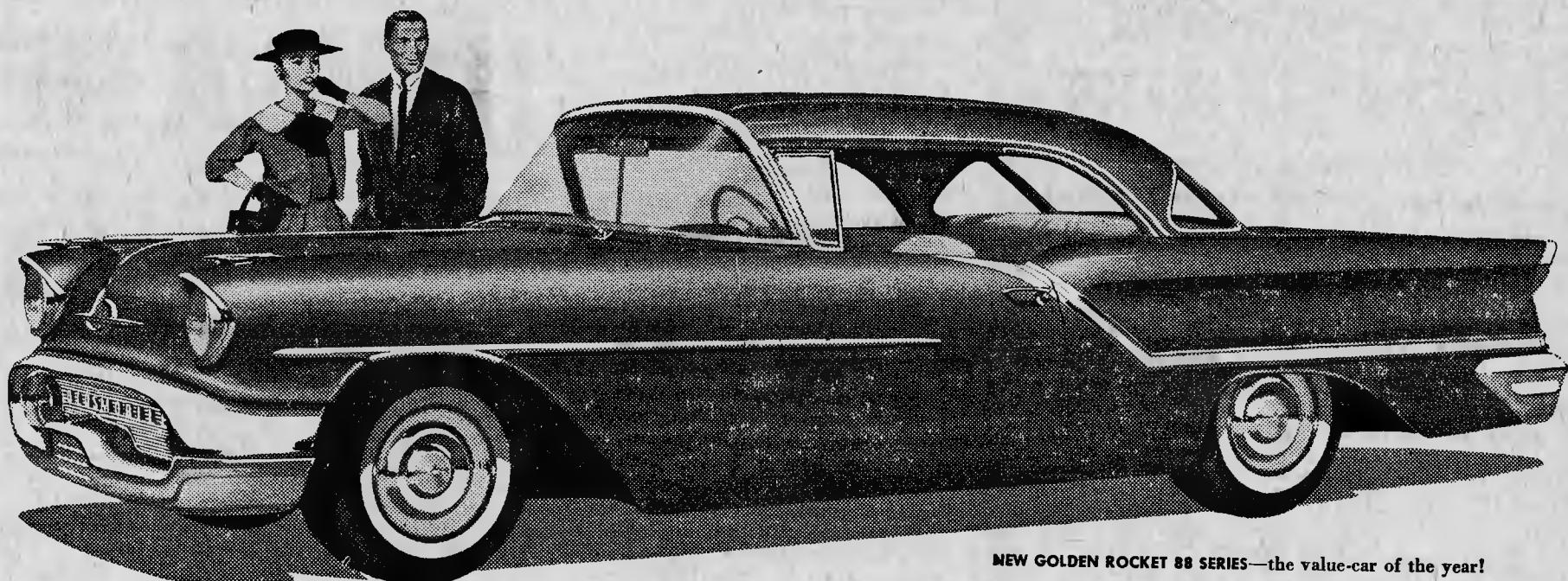
NEW GOLDEN ROCKET 88 SERIES—the value-car of the year!