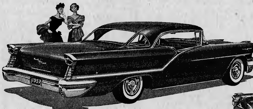
NEW STARFIRE 98 SERIES—there's nothing quite like it!

3 NEW SERIES! 17 ALL-NEW MODELS! See them now—in our showroom!