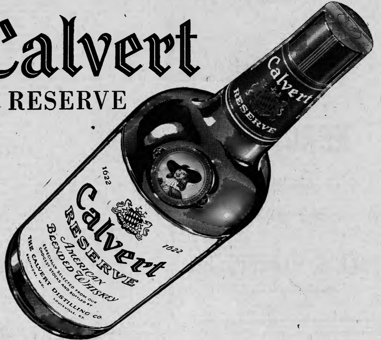
CALVERT DISTILLERS COMPANY, NEW YORK CITY • BLENDED WHISKEY • 86.8 PROOF • 65% GRAIN NEUTRAL SPIRITS