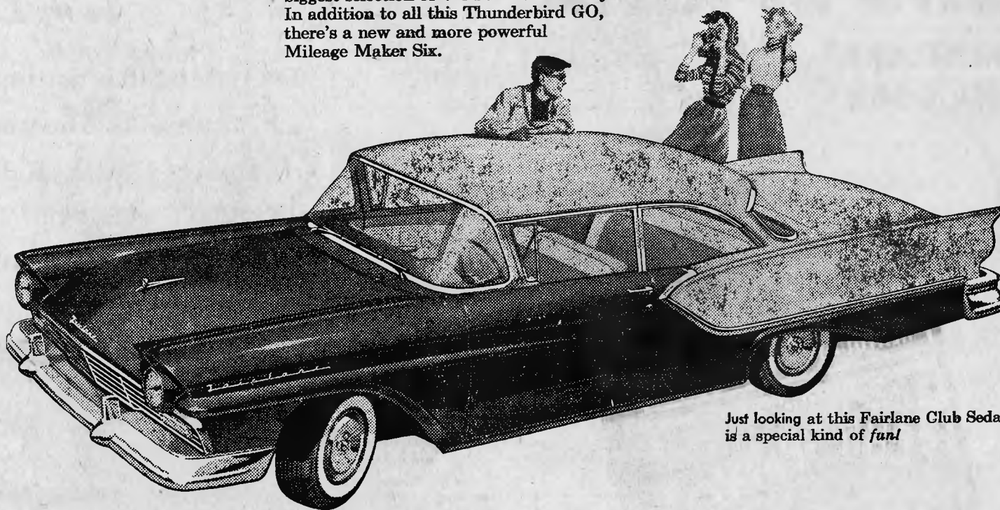
Just looking at this Fairlane Club Sedan is a special kind of fun!

It's the record-breaking performance. On the Salt Flats at Bonneville, Utah, a '57 Ford traveled 50,000 miles in less than 20 days . . . an average speed of 108.16 mph, including all pit stops! Another Ford averaged over 107 mph. Altogether, 458 national and international performance records were smashed as Ford rewrote the record book.