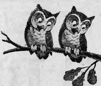
"Six or V-8, the going is great!"

It's the Thunderbird power. Ford celebrates its Silver Anniversary of V-8 leadership with the biggest selection of V-8's in Ford history.* In addition to all this Thunderbird GO, there's a new and more powerful Mileage Maker Six.