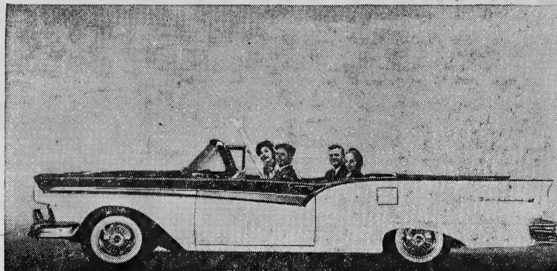
A 1957 FORD CAR offering the advantages of both the hardtop and the convertible represents the first revolutionary new idea in automotive design since the development of the closed car 40 years ago. To change the hardtop into a convertible, the driver simply presses a button and the all-steel top automatically slides into the trunk where it is completely concealed. It's equally simple to raise the top. The center picture shows the top in operation. Production of the car, a Ford first, will start in January.