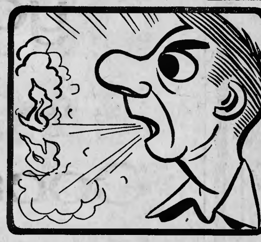
BUT - THIS MORNING GEORGE IS SLIGHTLY