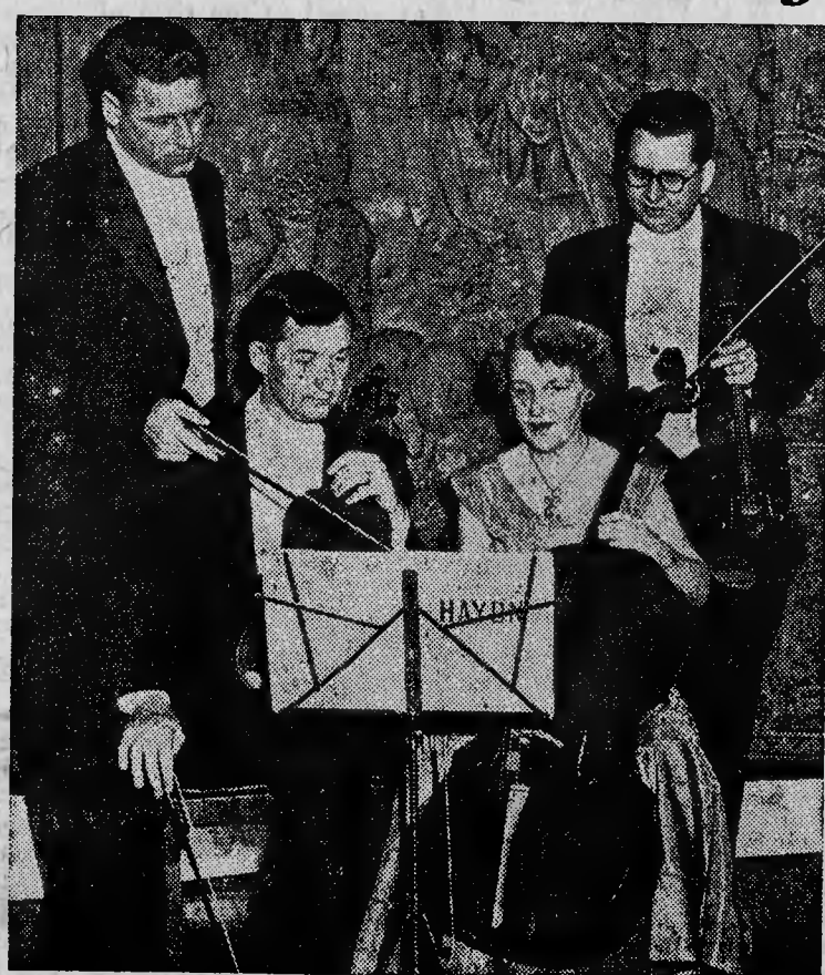
THE ALABAMA STRING QUARTET

This will be followed by four shorter selections—"Londonderry Air," arranged by Frank Bridge; "The Mill" by Raff; Borodin's "Nocturne" and pieces from "Mikrokosmos" by Bartok. Following the intermission and concluding the concert, the group will play Beethoven's Quartet in F major, Op. 135—the last of