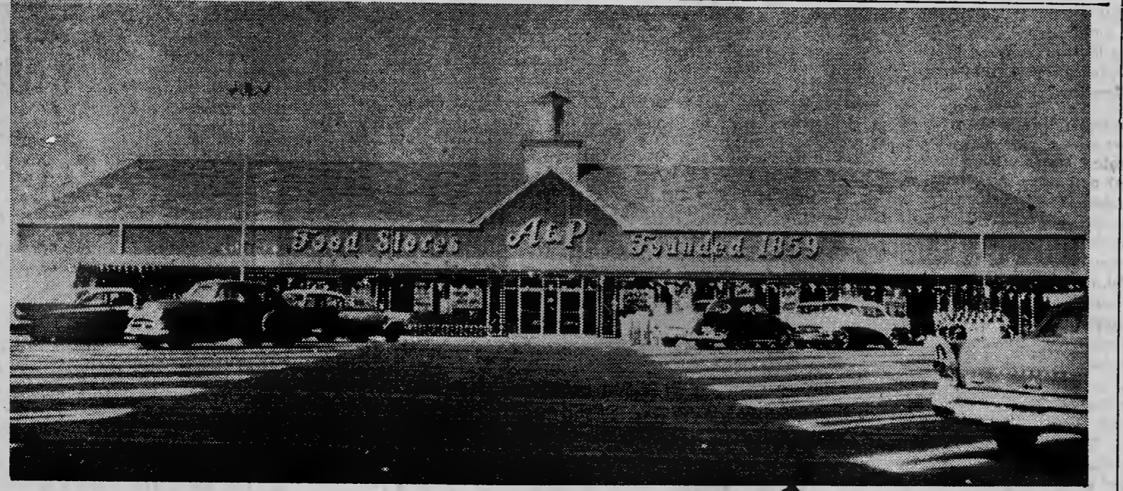
VIEW OF ANOTHER A&P THAT RESEMBLES THE ONE TO BE CONSTRUCTED HERE