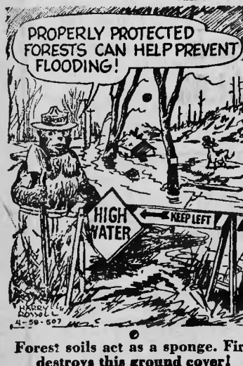
Forest soils act as a sponge. Fire destroys this ground cover!