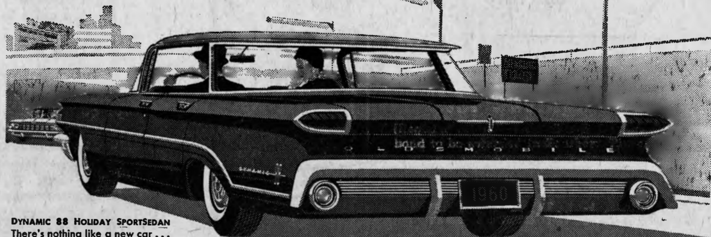
DYNAMIC 88 HOLIDAY SPORTSEDAN There's nothing like a new car... make yours a Rocket Engine Olds!

OLDSMOBILE FOR '60 SEE YOUR LOCAL AUTHORIZED OLDSMOBILE QUALITY DEALER!