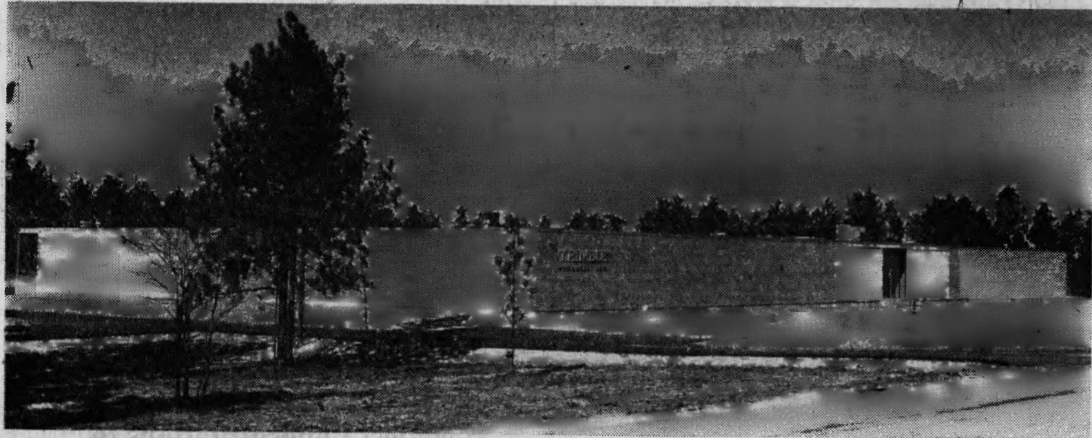
The New Plant of Trimble Products, Inc., Looking West from Access Road. Main Entrance at Right