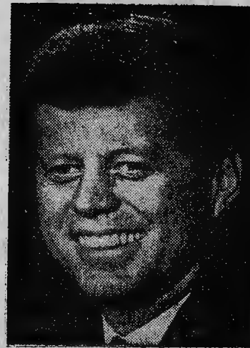
JOHN F. KENNEDY President