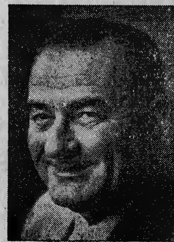
LYNDON B. JOHNSON Vice President