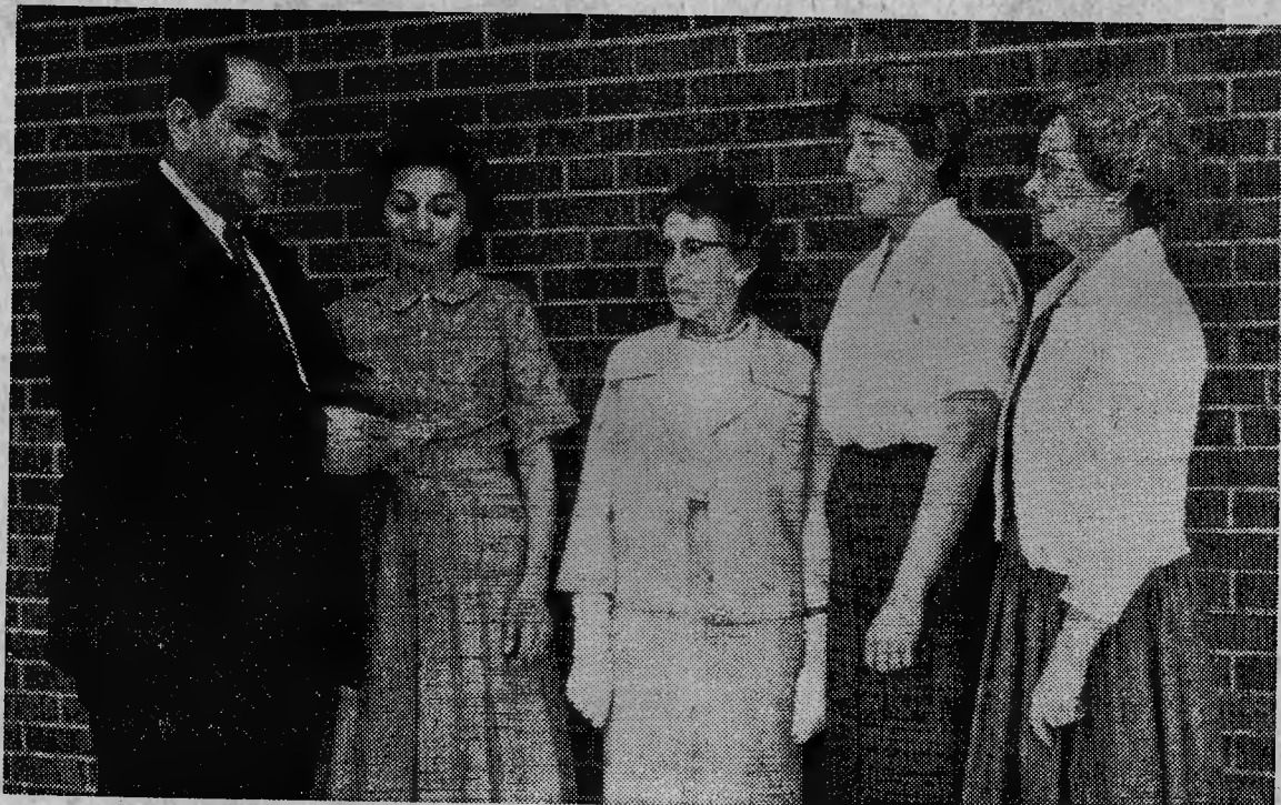
COLLECTION DRIVE TO BE HELD MAY 20