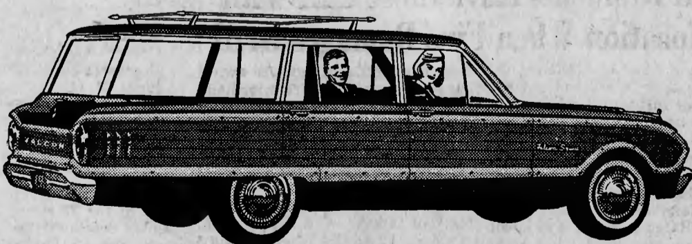
FALCON SQUIRE WAGON... Brand new for '62, it's sleek, sophisticated... and the only compact wagon of its kind. Inside, it is available with Futura bucket seats and a handy console! Outside, it has steel side paneling with elegant woodlike finish.