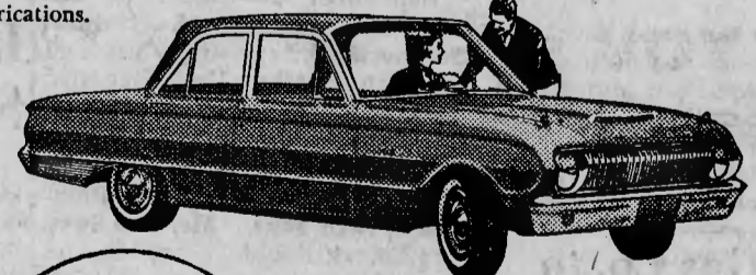
FALCON FORDOR SEDAN... Just one of 13 Falcons for 1962, this 4-door sedan has an improved version of the Falcon Six engine that last spring recorded the best gas mileage for a Six or Eight in the 25-year history of the Mobilgas Economy Run. Falcon's low price for '62 makes it America's best compact value!