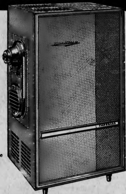
MODEL 776 Coronado Beige and Granada Tan