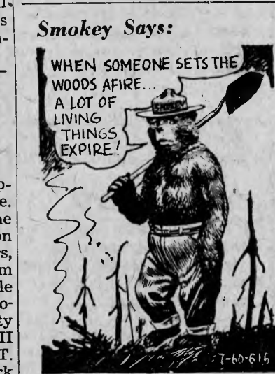
Let's all take care!

Purpose of the club is to build RANKS SECOND Georgia ranked second only to Wisconsin in the production of paper and board products during 1960 with an output of 2,047,379 tons. Other Southern states which produced more than a million tons each were Alabama, Florida, Louisiana, North Carolina, South Carolina and Virginia.