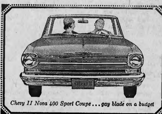
Chevy II Nova 400 Sport Coupe... gay blade on a budget