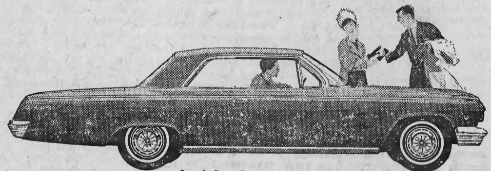
Impala Sport Coupe... goes as smooth as it looks

Come in and drive any (or all three) of these new cars for '62