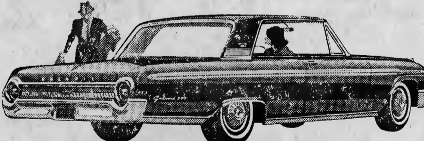
GALAXIE BY FORD

The class for families who want big car comfort, performance and prestige. Value leader is the Ford Galaxie—which has every essential feature of far costlier fine cars. With the optional Thunderbird 390 V-8 engine, a Galaxie will outperform America's most expensive luxury cars. Requires servicing only twice a year, or every 6,000 miles.