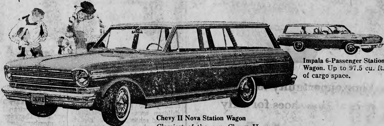
Chevy II Nova Station Wagon Classiest of the new Chevy II wagon crew with rich appointments and a spunky six.

... in a beautiful variety of styles, sizes and prices