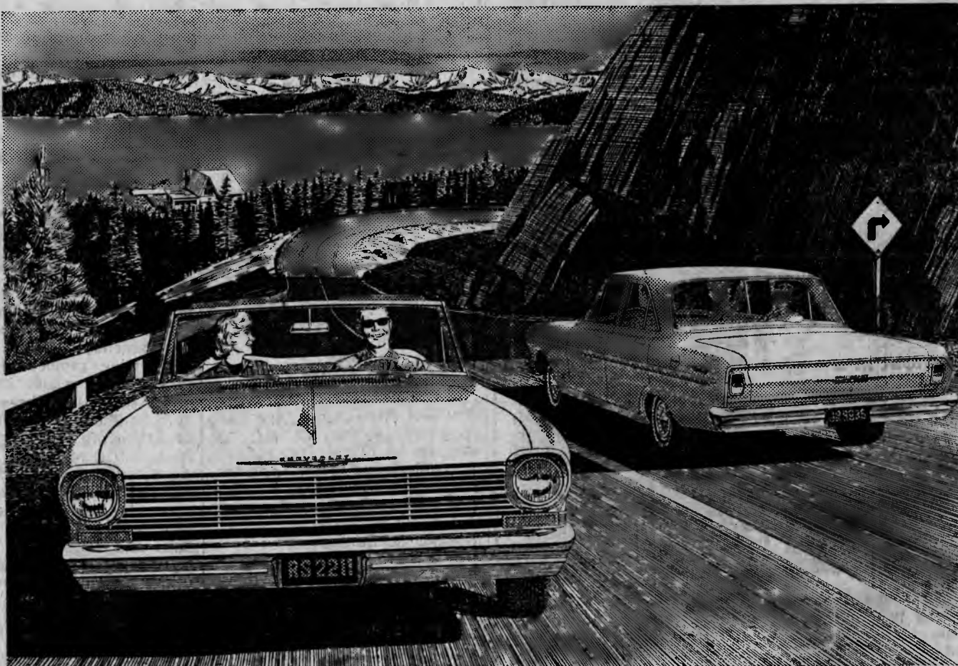
The sporty Chevy II Nova Convertible and sprightly 4-Door Sedan

See the new Chevy II at your local authorized Chevrolet dealer's