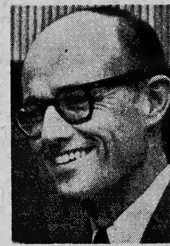
JOHN P. KENNEDY