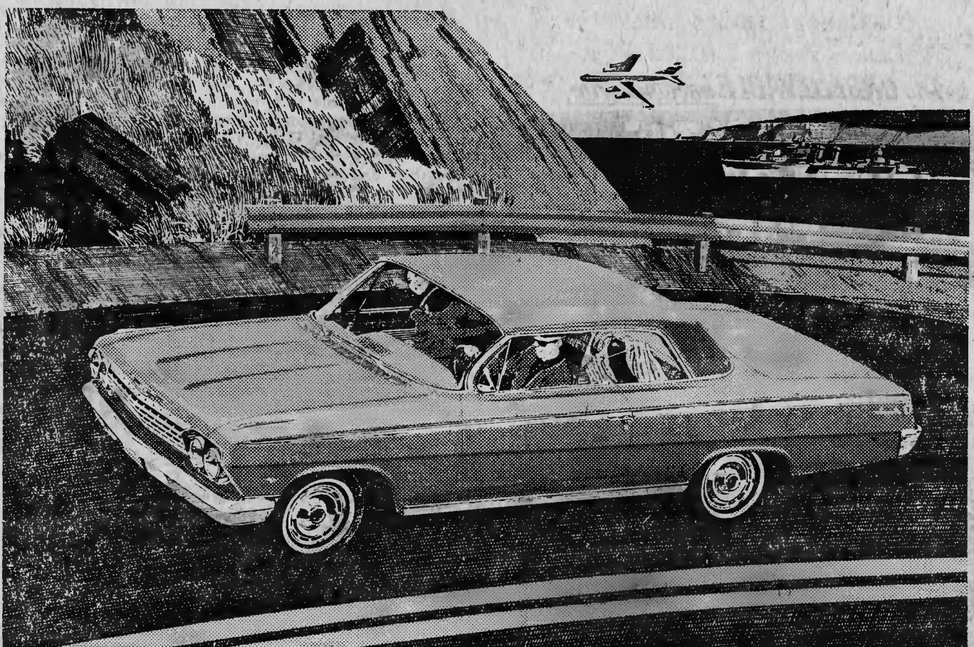
Impala Sport Coupe—here's about everything you'd expect of an expensive car—except the expense.

the car that gives you more to be happy about (right up through trade-in time) More car for your money when you buy, more money for your car when you trade! That's our Jet-smooth Chevrolet with rich, comfortable interiors that make you feel kind-of pampered. Body by Fisher craftsmanship that pleases the perfectionist in you. Vigorous V8's or a savings-savvy 6 you'll get a kick out of bossing. Space (and how!), grace and a ride so gentle you'll think all the bumps have gone into hiding. Comes trade-in time, you still sit pretty because you're handing over a Chevrolet — which year after year brings a higher resale return than any other full-size car in its field* More? Plenty—as your dealer'll happily tick off for you. JET-SMOOTH CHEVROLET *Based on used car prices published in the National Automobile Dealers Association USED CAR GUIDE. See the new Chevrolet at your local authorized Chevrolet dealer's