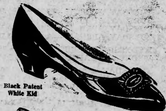
Black Patent White Kid