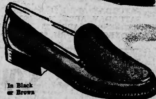
In Black or Brown

Good shoes, well fitted, are a must for growing feet. That's why we've used only the finest materials and workmanship in Buster Brown Shoes for more than three generations. And we take such care to insure your child a perfect fit with the famous Buster Brown 6-Point Fitting Plan.