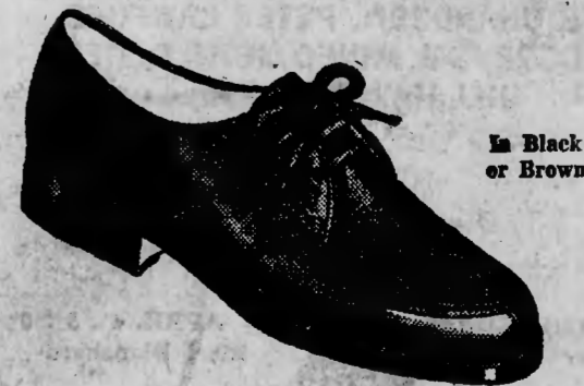
In Black or Brown