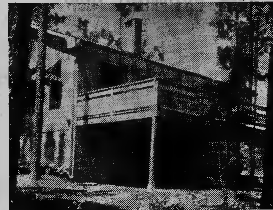
DECK & CARPORT REAR

On well landscaped lot. Nestled in the pines. In Residential Pinebluff Overlooking Silver Lake 2 Bedrooms Central heat & Air conditioning. $11,200