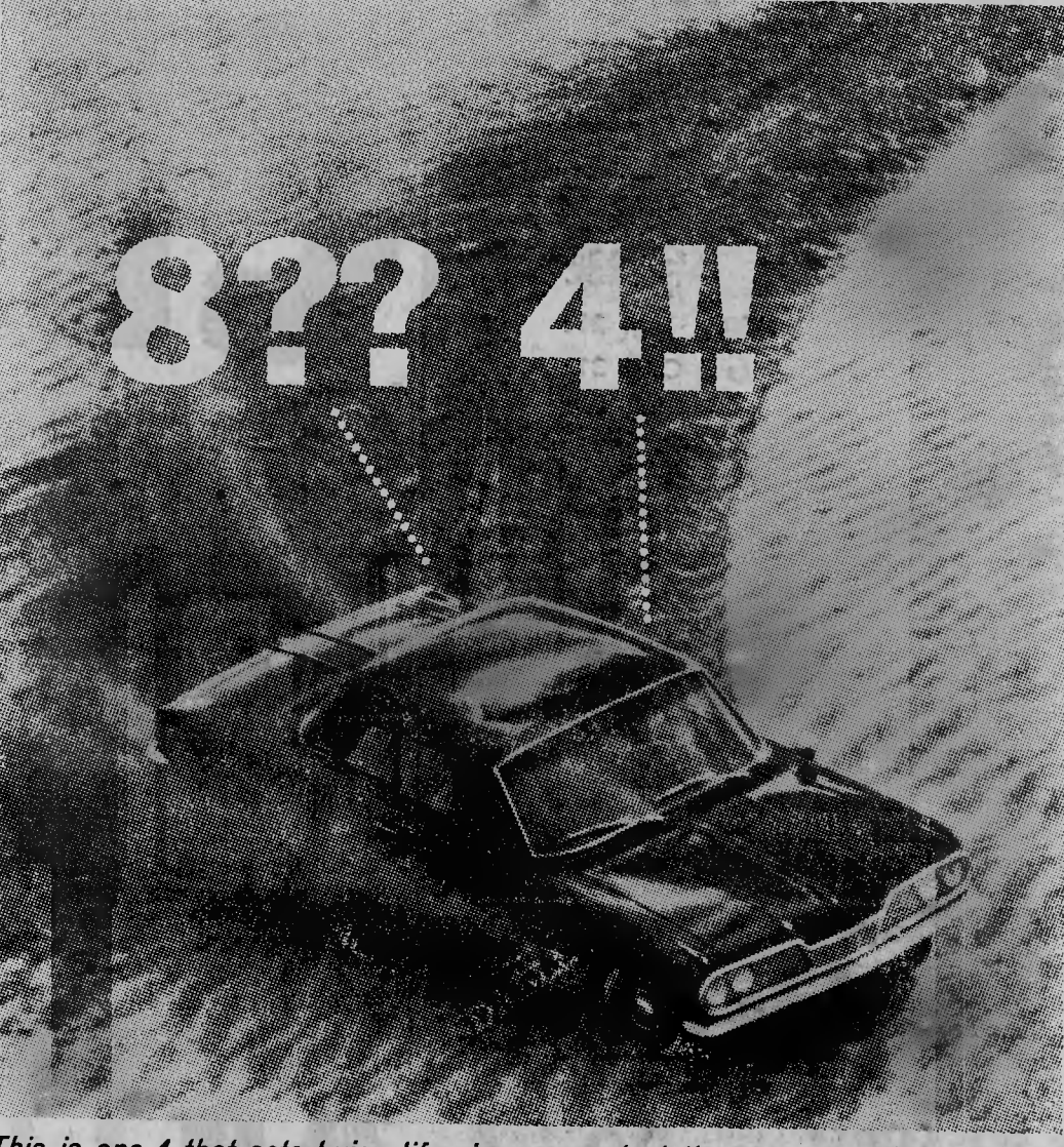
This is one 4 that acts twice life size—except at the gas pump. (As a matter

of fact, a Tempest 4 with automatic transmission won its class in the recent