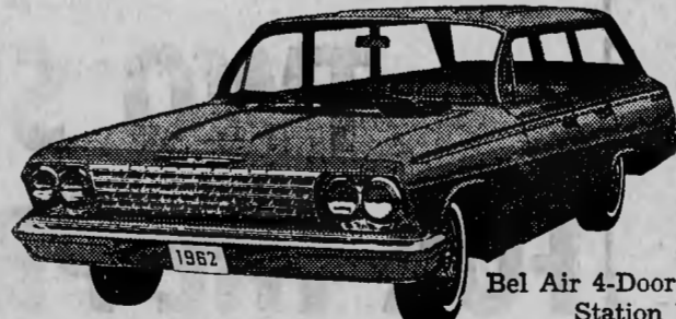
Bel Air 4-Door 6-Passenger Station Wagon

PICK YOUR PRICE: PICK YOUR TERMS ON THE CHEVROLET OF YOUR CHOICE