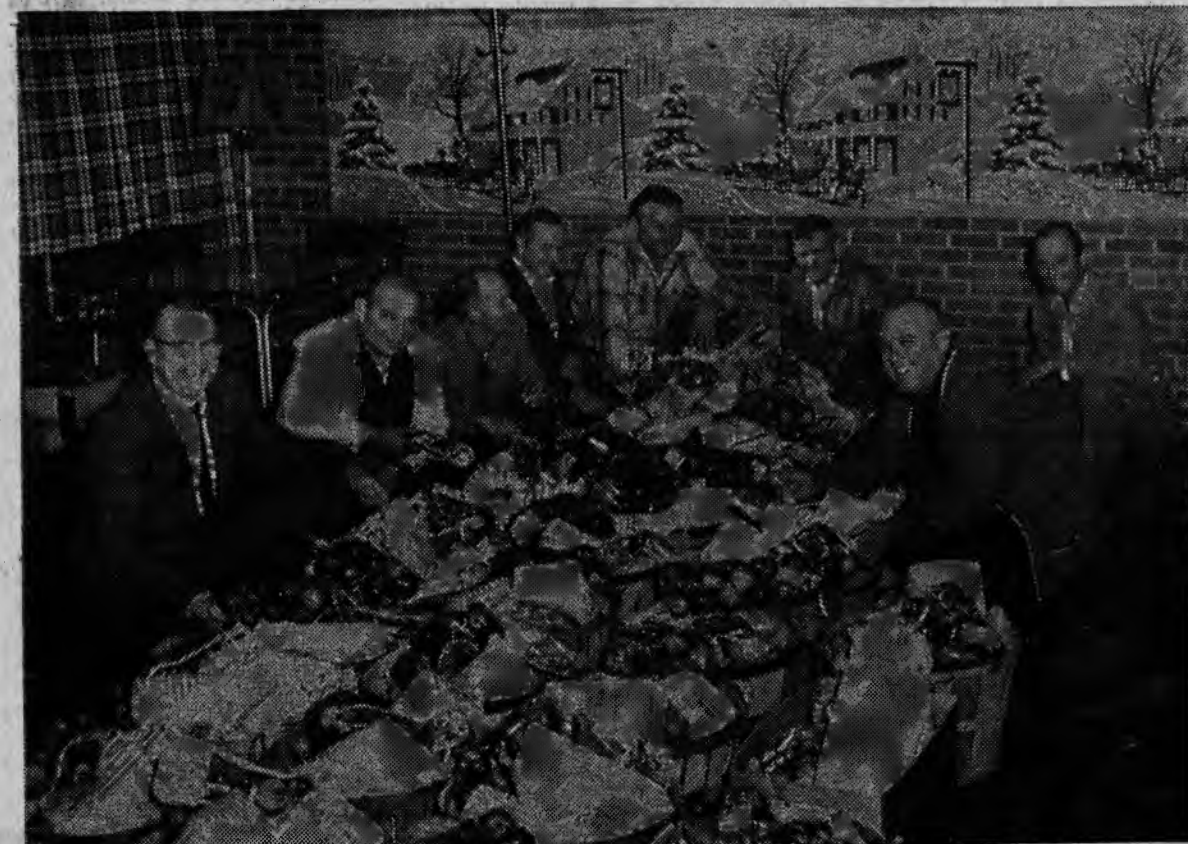
CHRISTMAS CHEER —A few of the dozens of Christmas Cheer baskets packed and delivered in Southern Pines and nearby area by members of John Boyd Post, Veterans of Foreign Wars, are pictured here with a group of the veterans on hand Monday afternoon at the post home to make deliveries. The baskets went to families whose need was certified by the Moore County Welfare Department. Similar

Christmas Cheer deliveries were made throughout the county by various civic and fraternal organizations and individuals cooperating with the Welfare Department program. Toys were included with baskets for families with children, so far as possible. The local Moose Lodge repaired broken toys to be given away. Barrels placed in food stores brought donations of many grocery items.