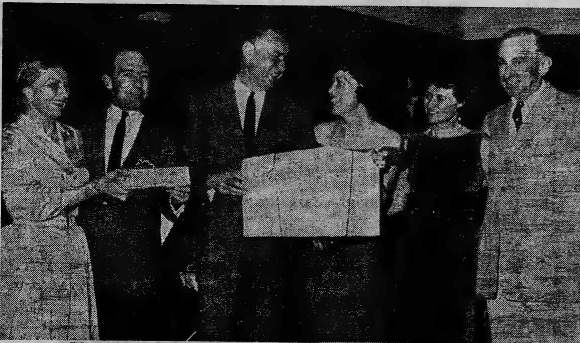
NEW HUNTER'S PACE EVENT PROVES SUCCESSFUL