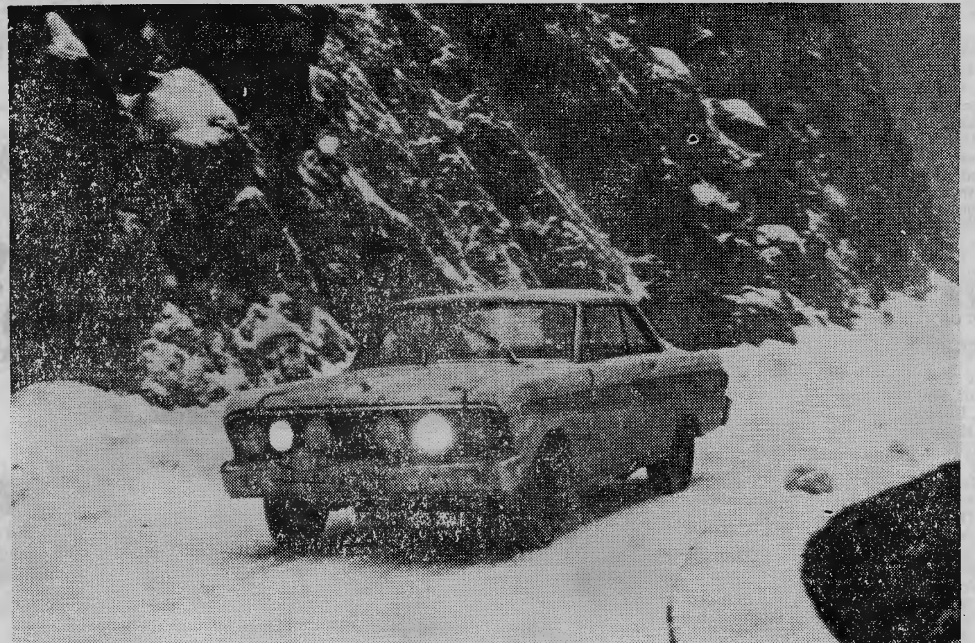
Four Falcons started from Oslo, four from Paris, on routes calculated to be equal in difficulty and length. Weather conditions varied from clear, bitter cold through freezing fog to blinding snow—and the time schedules made no provision for delays. Here a Falcon swirls through a sudden snow shower, testing traction in a practice run.

Falcon entered two classes in Europe's 2,700-mile winter ordeal—won them both and finished 2nd overall out of 299 cars. That's durability!