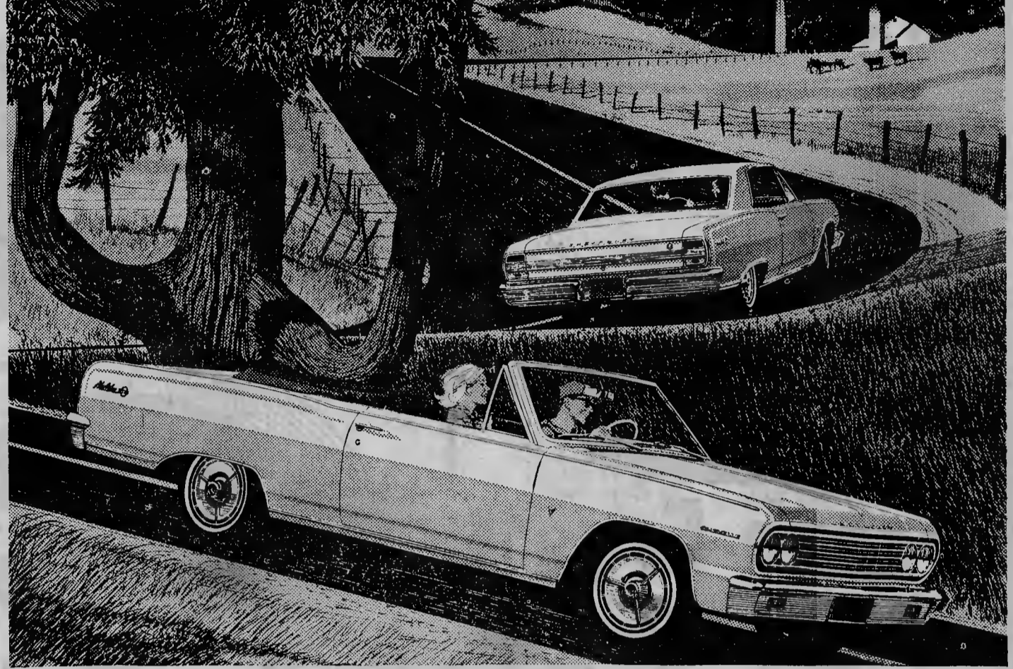
Background, new Chevelle Malibu Super Sport Coupe; foreground, Chevelle Malibu Super Sport Convertible.