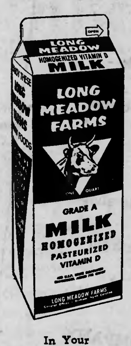
Grocer's Dairy Case "100% Locally Produced"