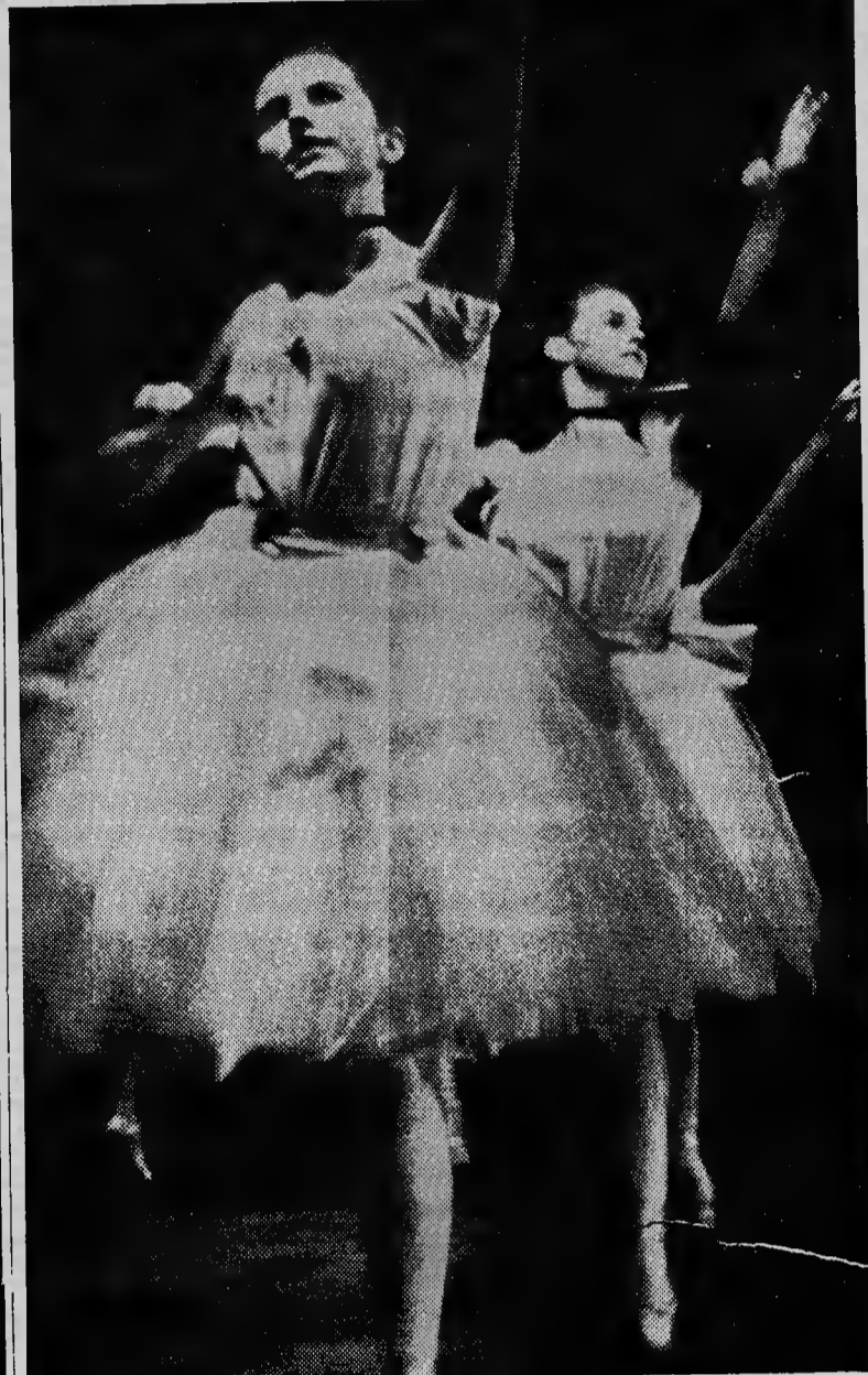
ON POINT—Several members of the N. C. State Ballet's First Company, which will appear at the Pinehurst Auditorium November 18, are caught in an action photo during a performance.