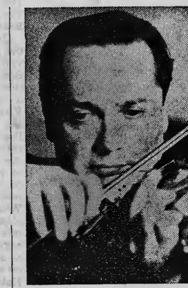
GIORGIO CIOMPI Guest Soloist

The purpose of the Guidance Workshop is to make known to the teachers the services available to the teachers and the students through the guidance personnel employed in the local schools.