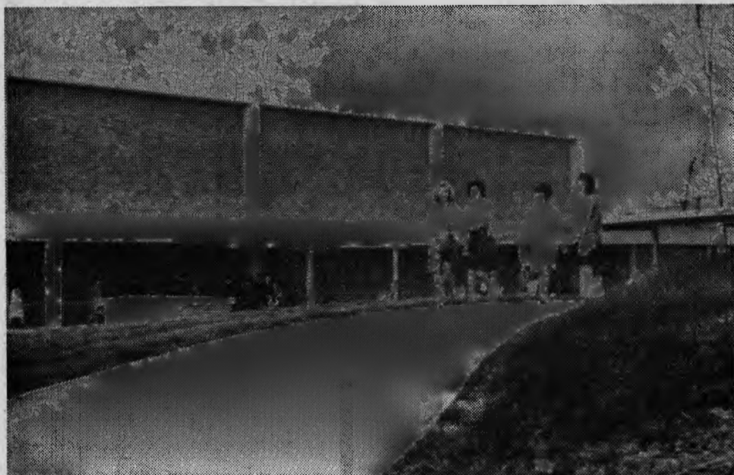
ON SCHOOL CAMPUS — Following Sunday's dedication, visitors of all ages, as well as students, looked over the 53-acre campus and buildings of the new North Moore High School. Above, students follow a winding walkway, with the auditorium-gymnasium building in the background and a glimpse of a breezeway to a classroom building at right.

is constant behind the scenes at the UN. For an insider's report, see page 1, section 2.