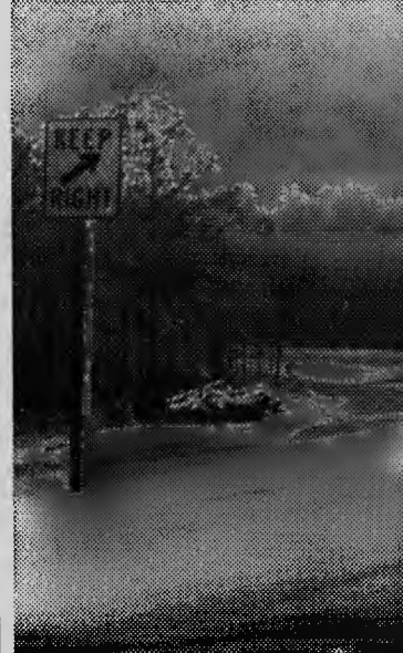
COMPLETED PROJECT — The new divided highway constructed by the State at the entrance to the Country Club of North Carolina and its large associated Royal Dornoch Golf Village residential development is shown here, looking toward Southern Pines, as if driving from Pinehurst. Car in right background is emerging from the Country Club's entrance road. The improvement project extends somewhat around the curve in left background, where a culvert was built for one of the streams that feeds Watson's Lake on the development's property.