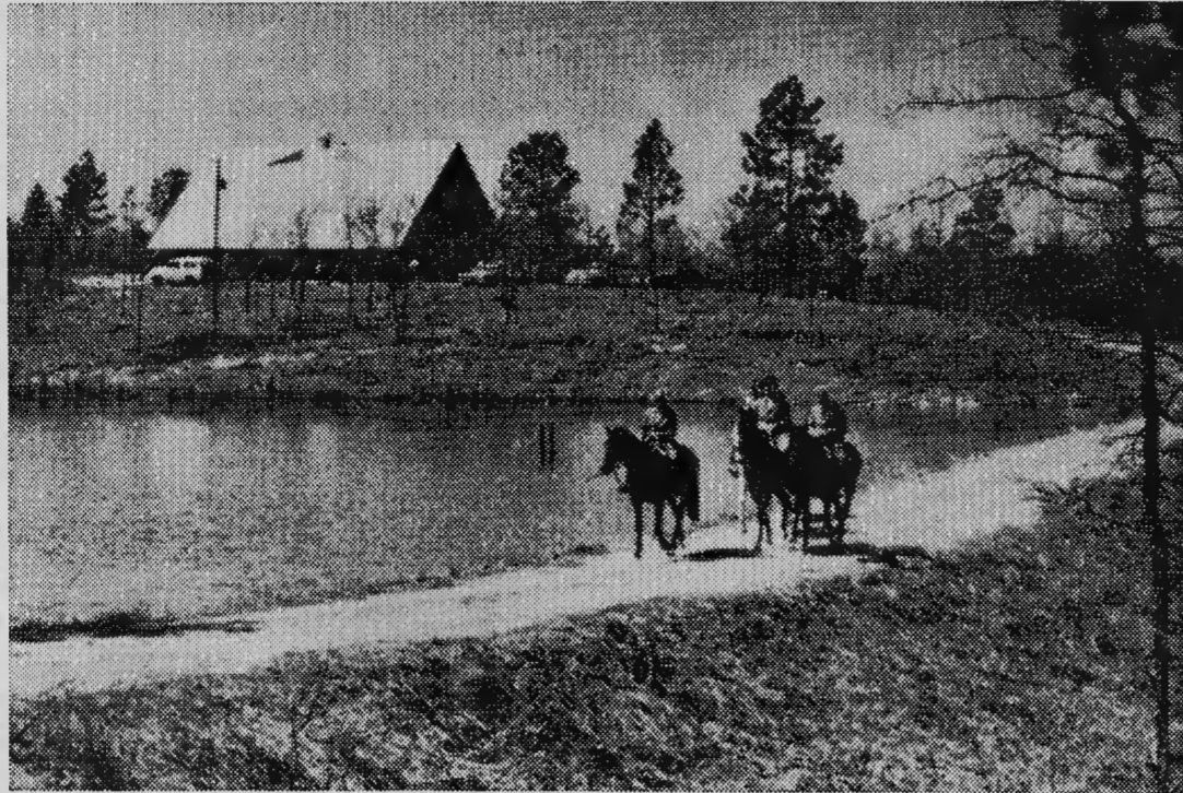
ON 50-MILE RIDE—A group of participants in last Friday's annual 50-Mile Pleasure Ride, sponsored by the Moore County Hounds and the Town of Southern Pines, leave the striking, big "A-frame" lodge of the Moore County Wildlife Club near Niagara, after breaking their ride for lunch there, along with others taking part. A Junior Ride took place on Saturday. Both groups followed a marked trail and horses were carefully examined for condition, before and after the rides. A picture of award winners and other details are on another page.

Living accommodations will be furnished at Pinehurst in the Radcliffe Cottage on the grounds of the Holly Inn, the Pinehurst hotel that remains open for the summer, and (Continued on Page 6)