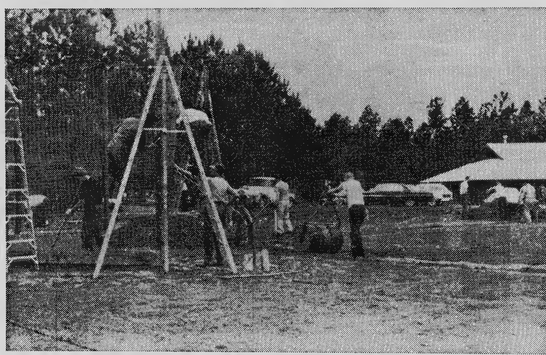
VOLUNTEER GULISTAN GROUP WORKS ALL DAY

J. H. Edmonds of Cameron submitted the low bid of $70,566 for general construction. The plumbing contract for $5,075 went to Carroll and Gift. (Continued on Page 6)