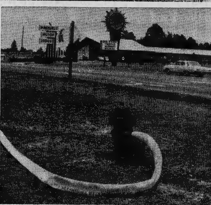
LIFE-LINE — The beginning (top) and end (below) of a 5,000-foot-long emergency fire hose water line set up last week to feed Southern Pines water into the depleted Aberdeen municipal water system are shown here. Locations of the hydrants are recognizable from the Holiday Inn sign, above, and the Pinehurst Motor Lodge sign, below, both on No. 1 highway, south. Photographer John Hemmer accompanied the Pinehurst Fire Department, one of several in the area donating hose for the line, to the scene of action and made these pictures, before water began to flow.