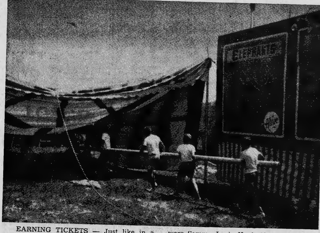
EARNING TICKETS — Just like in a story your father or grandfather might have told, five Aberdeen boys earned their tickets to the Sells and Gray circus last Friday morning by working alongside the circus hands in setting up the tents and other equipment. Here they are teaming (one not visible), to rush a pole to the sagging canvas in the background. The eager boys who worked for their circus fun

The Southern Pines Jaycees are going to hold their second annual fund-raising auction on Saturday, September 9, in the parking lot of the OK Bowl on S. W. Broad St.