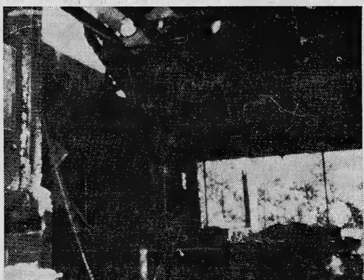
Ravages of Saturday fire shown in roof from interior of restaurant dining area.