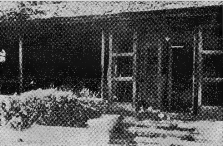
Front door and dining-room windows of Ye Olde Steak House as they looked after fire.

Some furnishings were saved, including filing cabinets (Continued on Page 2)