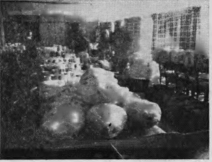
CHRISTMAS CHEER FROM VFW — Here's how the big hall of the John Boyd Post, Veterans of Foreign Wars, home on Broad Street looked last Saturday before VFW and VFW Auxiliary members packed the gifts of food into boxes for delivery to needy families. In foreground are turkeys. Contributions to the post's annual Christmas Cheer program were sufficient to provide a large box of food for more than 60 families. Churches in the area took care of 20 more families on the VFW list. The names of the families destined to receive the boxes were obtained