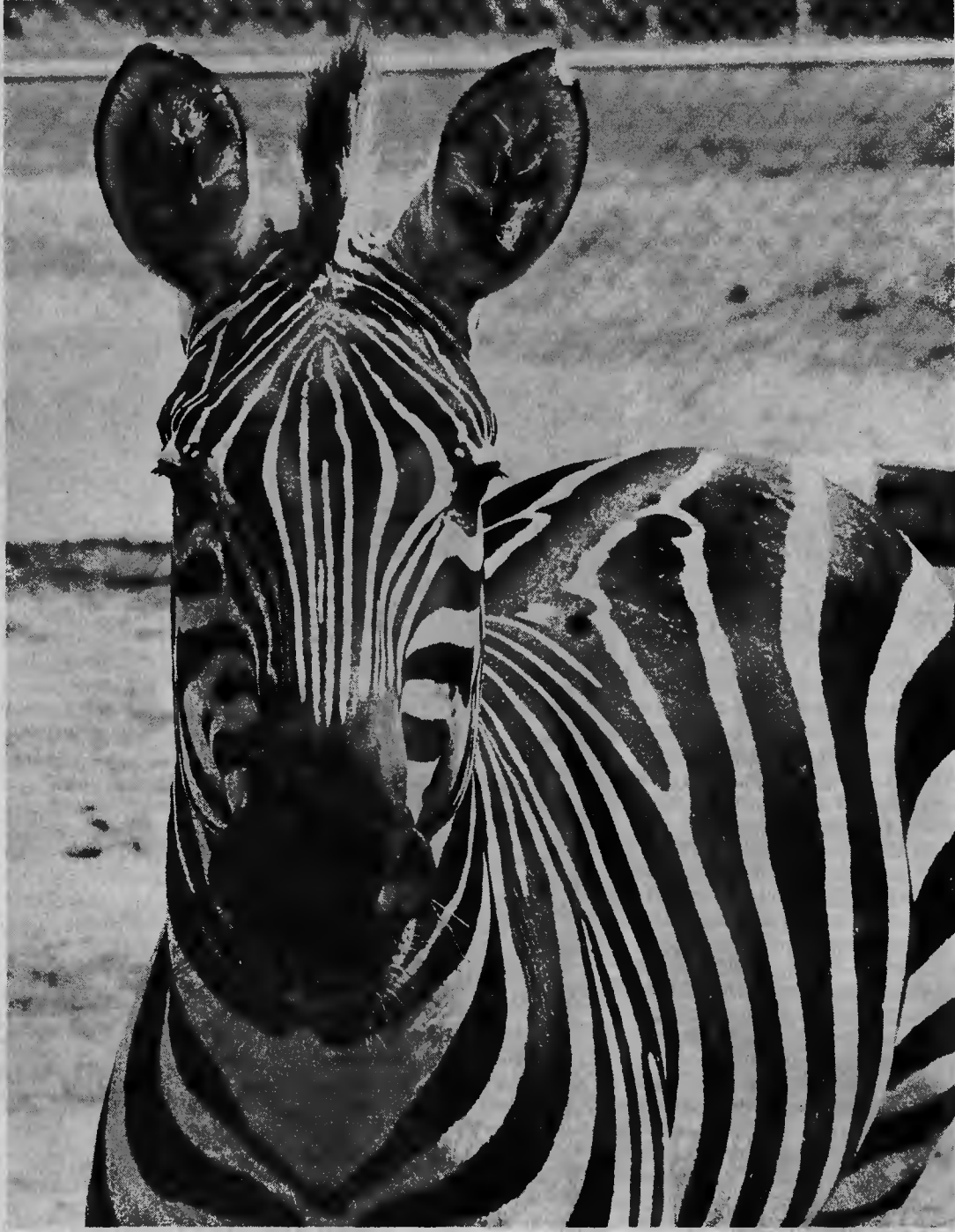
WHO'S ZOO?—Nobody's. This zebra is one of several of the exotic animals on a farm in Eastwood. A new baby zebra is shown at mealtime with her mother on another page.