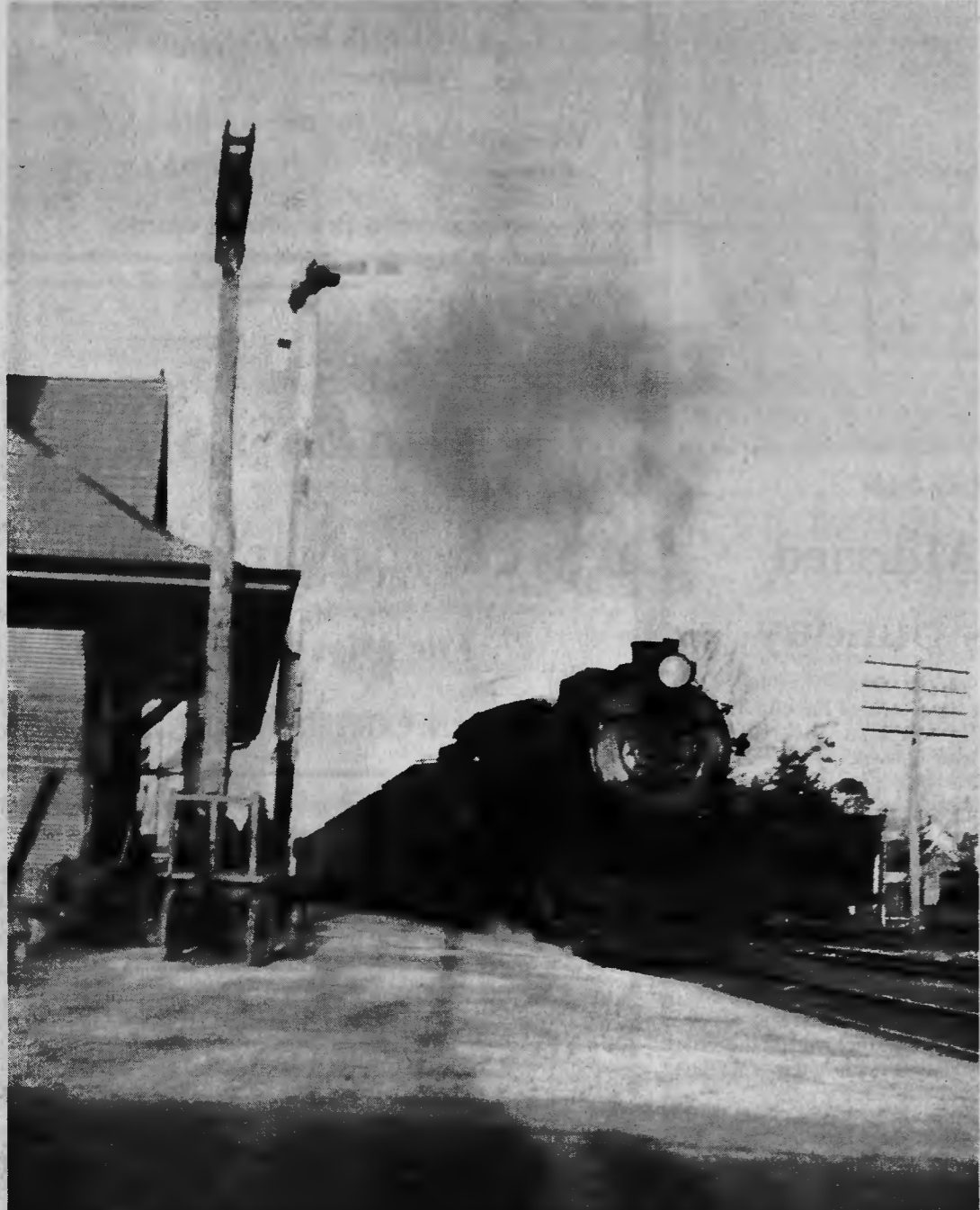
IN 1922 — The freights were already running in Southern Pines, which was built up around the railroad tracks for the convenience of tourists, but there were passenger trains, too. This early picture, taken in January, 1922, is by courtesy of the Department of Archives and History. Notice that it was made before the magnolias and other trees were planted along Broad Street.