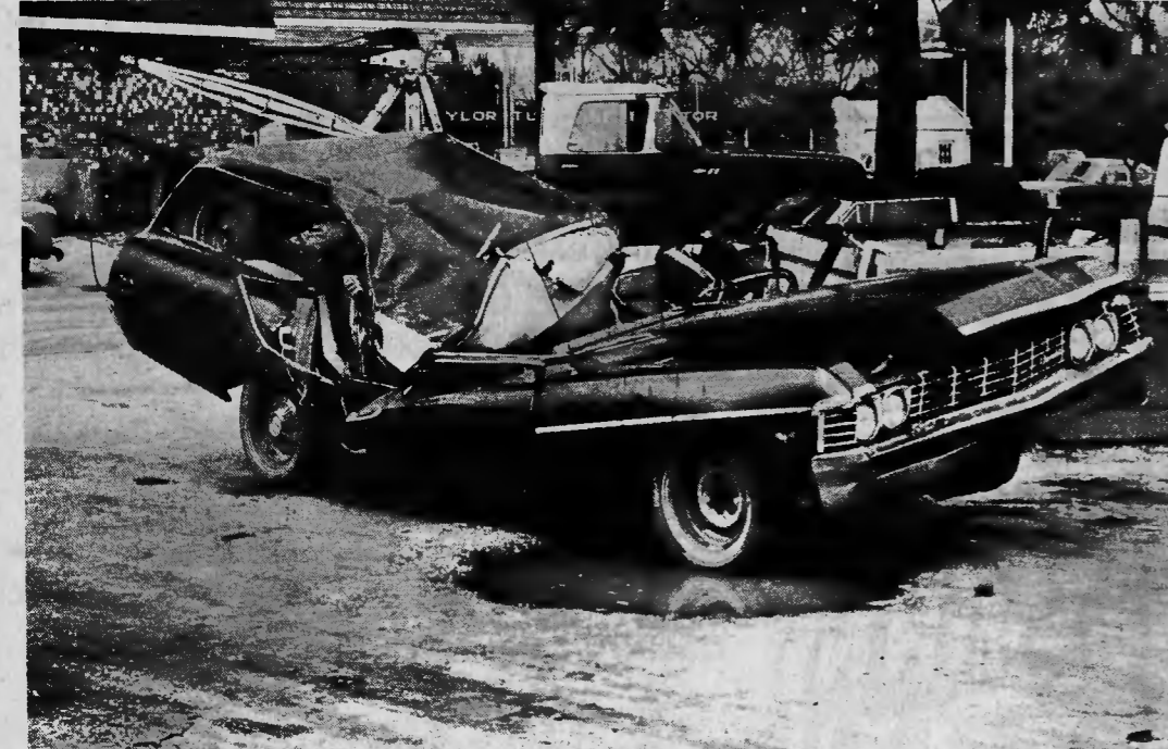
DEATH CAR — This is the wrecked automobile in which four persons were killed and three injured between Aberdeen and Pinehurst Saturday night.