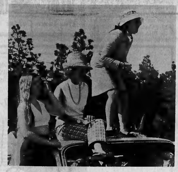
EXCITED FAN-A car top fan yells on her horse in a race at Stoneybrook on Saturday. More than 25,000 turned out for the 26th running of the Sandhills event.

about a length or a length and a half apart throughout most of the run, moving at nearly equal pace, with no spills or other untoward events.