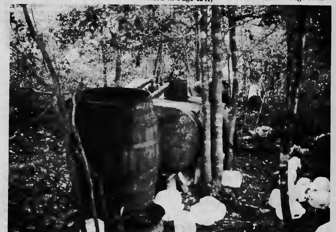
STILL STILLED—This 280 gallon liquor still and its contents were blown up by ABC and Sheriff's officers shortly after this picture was made Tuesday. Two men were arrested at the site near Mt. Pleasant Church.

the Senate hearings continue. UNIVERSITY—Several states—Louisiana, Missouri and Wisconsin among them—are watching with considerable interest to see how the new University of North Carolina system works out.