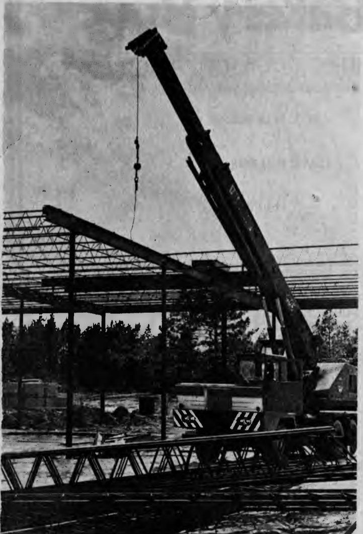
NEW BUILDING — Steel was going up this week for the new building for Winn-Dixie in the Town and Country Shopping Center. Several other new buildings are planned for the center.

naturally resulted in more instances of the disease here. Swamp fever is more correctly called equine infectious anemia (EIA), and is carried to horses by mosquitoes. There is no cure for it, but it is not necessarily fatal, the veterinarian explained. What it may do is make the infected horse so anemic that it succumbs to some other disease.