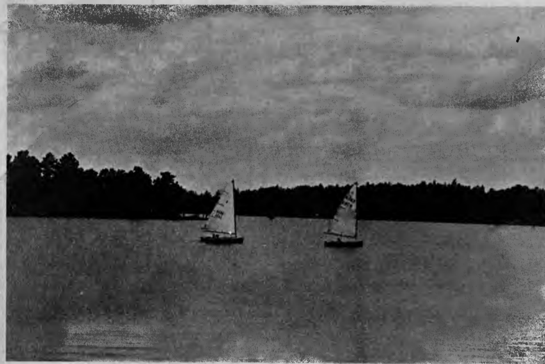
POPULAR PASTIME — Golf may be a prime passion in the Sandhills but water sports are becoming more and more popular in the summer. Here's a sailing scene on Whispering Pines' Spring Valley Lake.