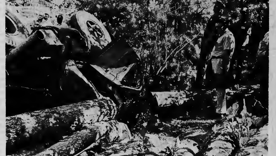
DRIVER KILLED — The driver of a loaded log truck, James T. Capel of Candor, was killed Tuesday morning when the truck overturned at the intersection of Highway 73 and US 15-501. It took two hours to remove the body from the wreckage. Coroner A.B. Parker is shown above at the scene of the fatality. — (Photo by Glenn M. Sides).